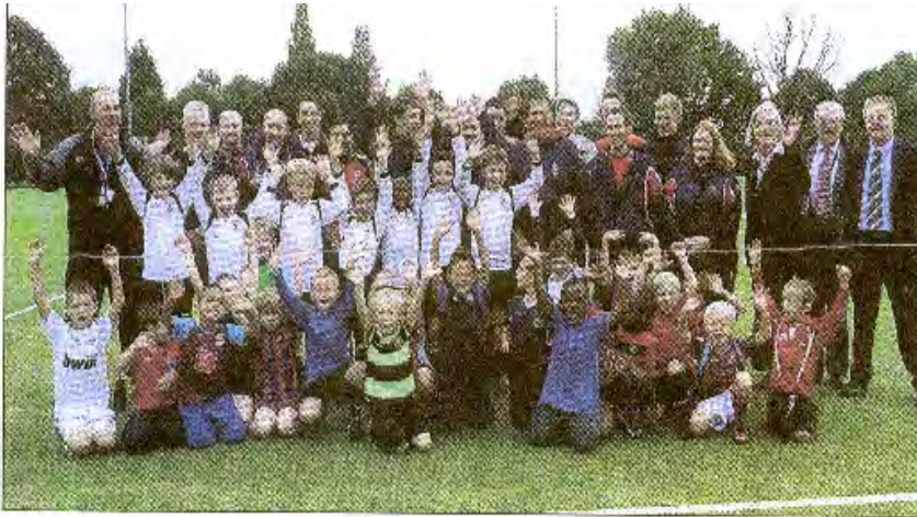
HOORAY! Hockey players, footballers and supporters came to celebrate the reopening of Sawyers Hall Community Sports Trust all-weather facility which has been closed for two months for refurbishment